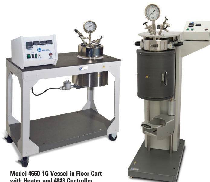
Model 4660-1G Vessel in Floor Cart with Heater and 4848 Controller