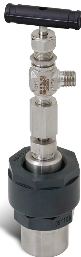
Model 4700-22mL-A Vessel shown with needle valve.

These vessels are normally heated in ovens, baths, or similar general purpose heating devices. Special heaters for these vessels are not available from Parr.