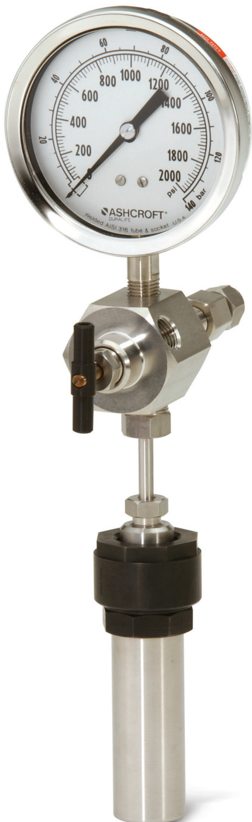
Model 4700-45mL-A Vessel, with 4310 Gage Block Assembly.

A composite identification number to be used when ordering a 4700 Series Pressure Vessel can be developed by combining individual symbols from the separate sections below. For more information on how to use this ordering guide, please see page 27.