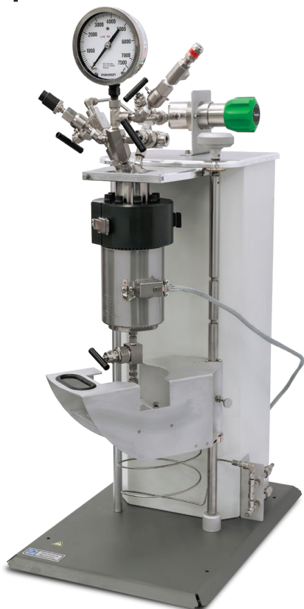
The 500 mL batch supercritical water extraction vessel pictured above is constructed of Hastelloy C-276 and is designed for use to 6000 psi (410 bar) at 400 °C.

A supercritical fluid is any substance at a temperature and pressure above its critical point. Such fluids can diffuse through solids like a gas and dissolve materials like a liquid. Near the critical point, small changes in pressure or temperature result in large changes in density, allowing many properties of a supercritical fluid to be “fine-tuned”. Supercritical fluids are often suitable substitutes for organic solvents in a range of industrial and laboratory processes.