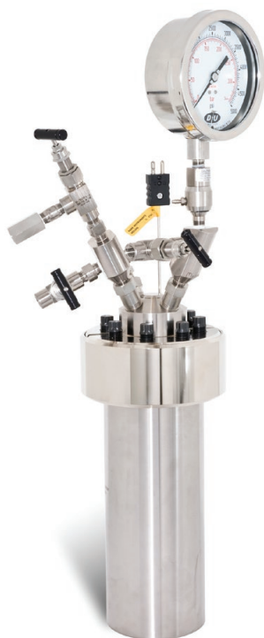
Model 4625-1200mL-VGR-DVD Vessel

Standard Maximum Operating Temperature, °C: 350 w/ PTFE Flat Gasket