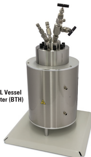
Model 4625-1200mL Vessel w/ Bench Top Heater (BTH)